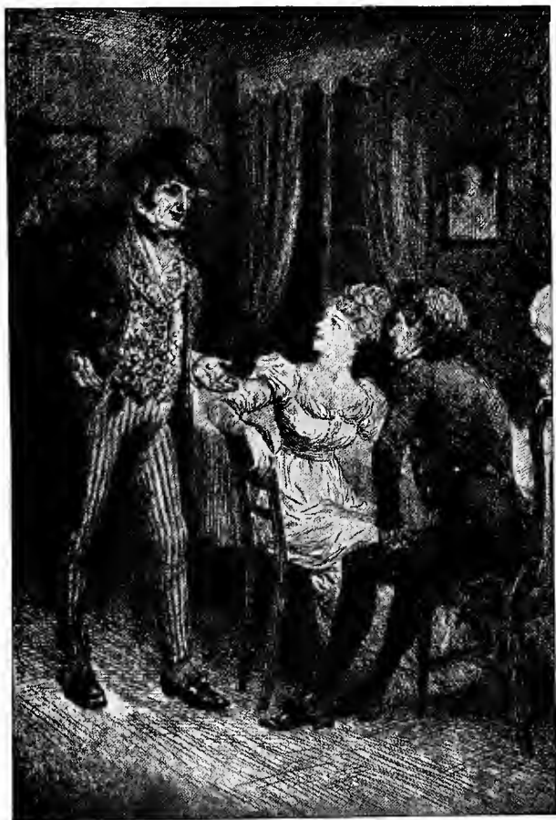
Vautrin came in in high spirits